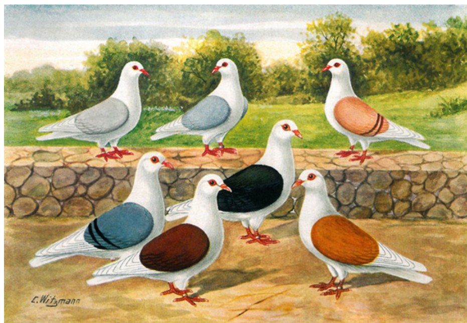
Fränkische Schildtauben (Samtschilder)